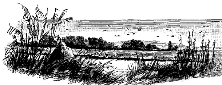
Приходи в парк